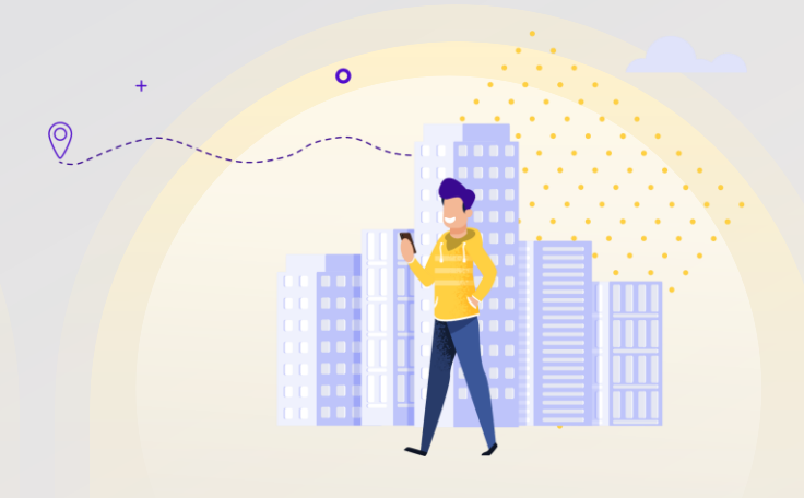
Efficient crossborder public services

A seamless digital experience for mobile citizens and businesses interacting with national authorities for social security purposes