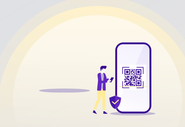
Citizen-centric approach to digitalisation

A seamless digital experience for mobile citizens and businesses interacting with national authorities for social security purposes