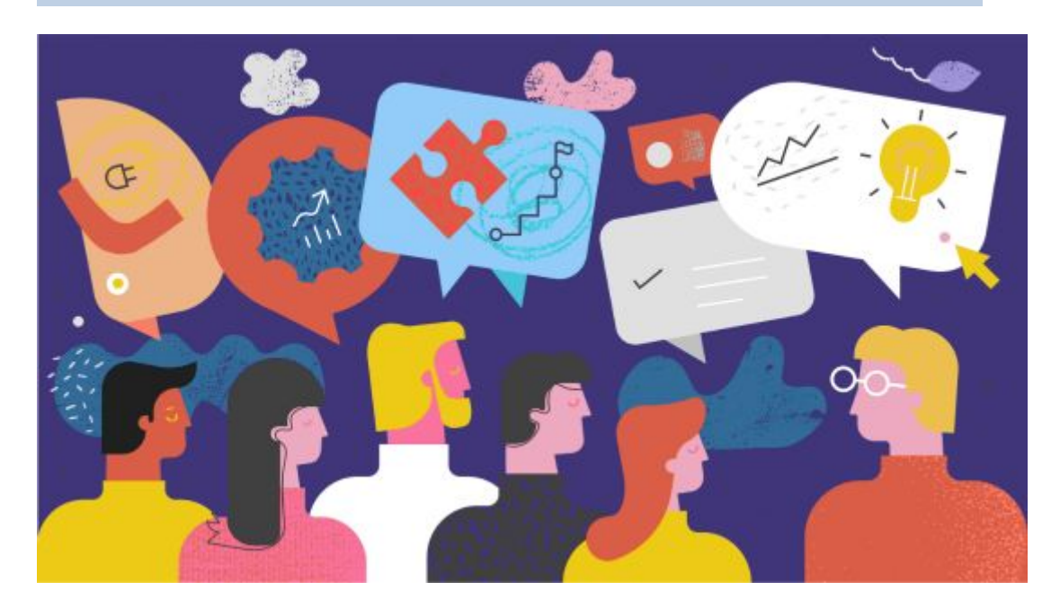
New PES Opinion Paper Contributes to the European Year of Skills Debate

Amid the green and digital transitions, workers must have the right skills to adapt to a changing labour market. In the context of the European Year of Skills 2023, the European Network of Public Employment Services (PES Network) just released an opinion paper, promoting successful approaches, highlighting challenges and offering recommendations to address each of the European Year of Skills' objectives. Read more .