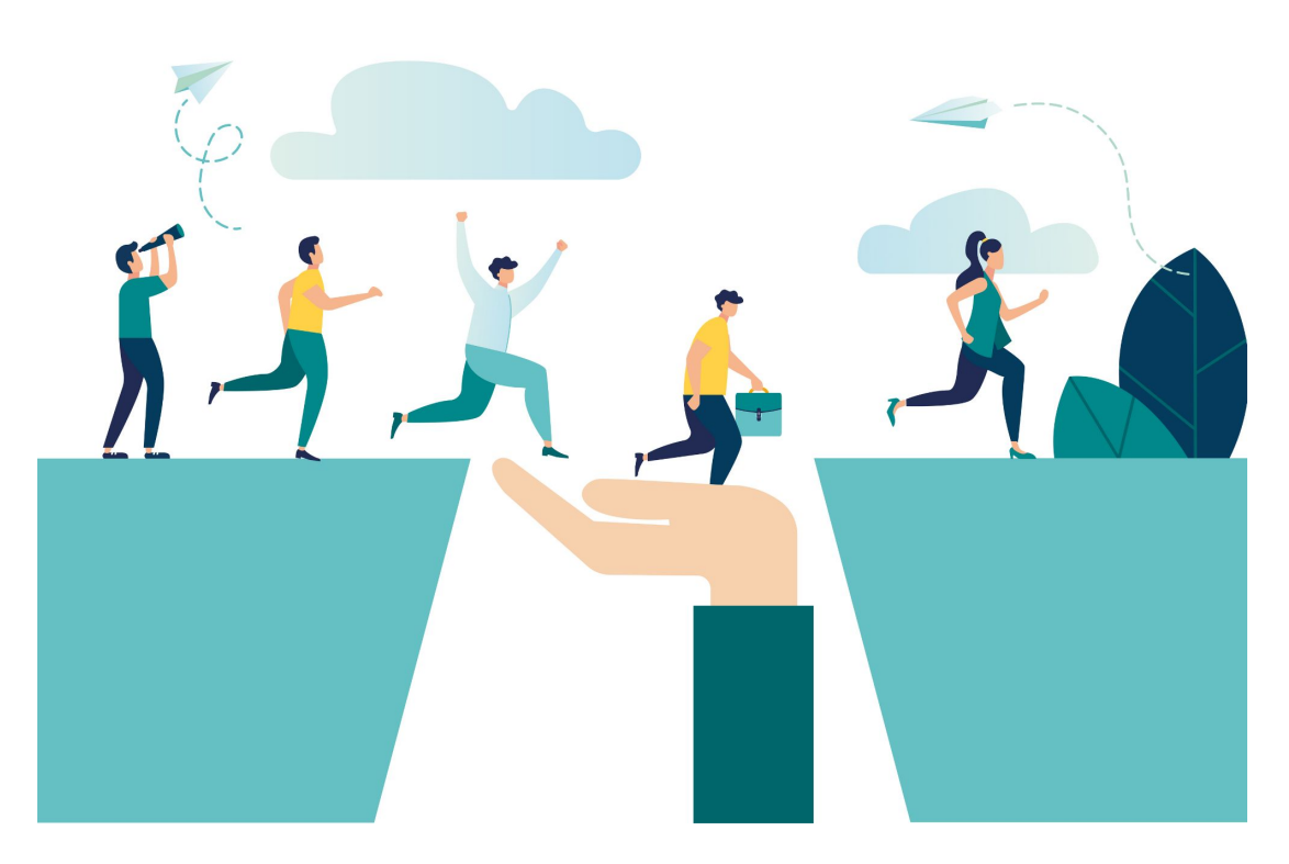
PES Network adopts 7 recommendations to guide employment ser vices assisting refugees and persons displaced from Ukraine

Amid the green and digital transitions, workers must have the right skills to adapt to a changing labour market. In the context of the European Year of Skills 2023, the European Network of Public Employment Services (PES Network) just released an opinion paper, promoting successful approaches, highlighting challenges and offering recommendations to address each of the European Year of Skills' objectives. Read more .