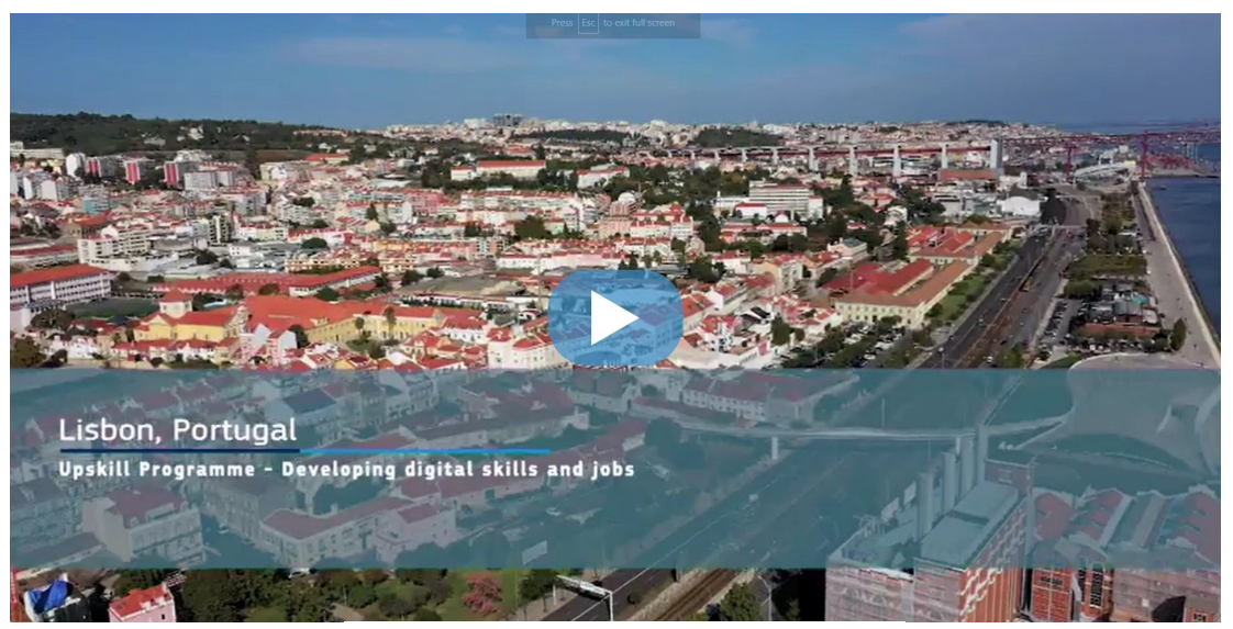
<u>'Upskill' programme in Portugal</u>