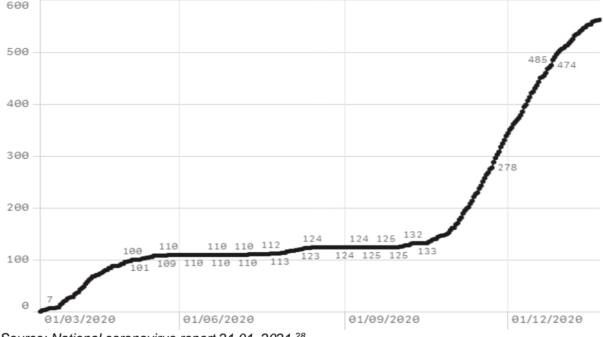
Figure 2: Cumulated number of deaths

The most recent number of deaths is 625 (21 February 2021).<sup>27</sup> However, it is not possible to indicate how many of these deaths affected people with disabilities.