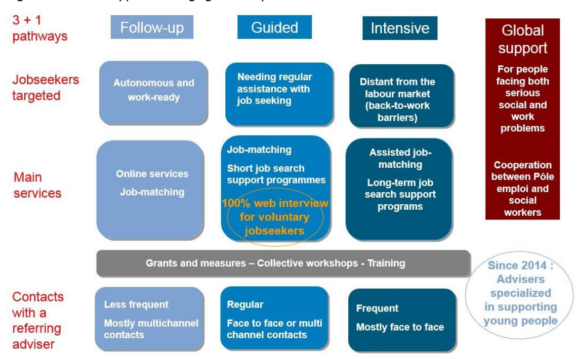
Figure 2. Four types of engagement paths

The French PES profiling system is based on caseworker assessment. In order to support the caseworker's appraisal, two tools are available. First, a labour market information tool ( information sur le marche du travail ), which is a statistical tool providing information on the local labour market situation (for instance, by identifying professional categories where there is a high level of demand). Second, a job matching tool ( systeme de rapprochement des offres ), based on a French national classification, allows the caseworker to match job offers with jobseekers' profiles, established on the basis of information given during the initial registration and diagnostic interview.