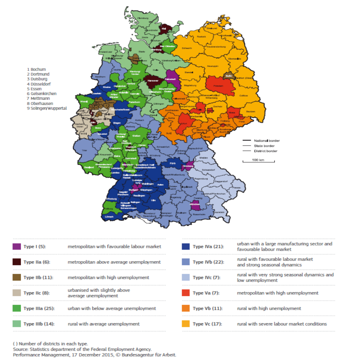
Figure 1. Regional distribution 12 German PES Clusters